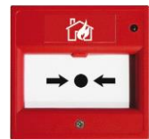
Figure 1 - Fire alarm