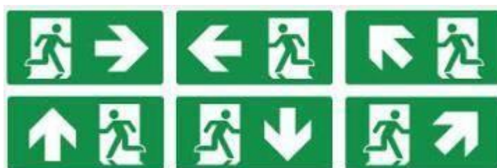
Figure 4 - Escape route signage