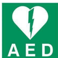
Figure 2 - AED symbol

There are AED at various central locations in the Jaarbeurs buildings; they are recognisable by the symbol below.