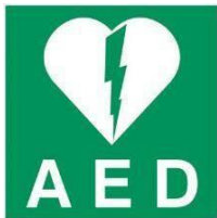
Figure 2 - AED symbol

There are AED at various central locations in the Jaarbeurs buildings; they are recognisable by the symbol below.