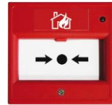
Figure 1 - Fire alarm