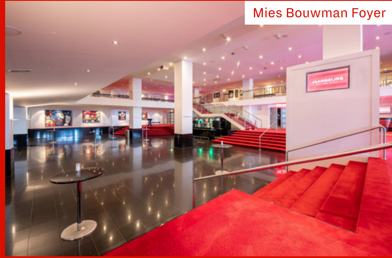
Mies Bouwman Foyer