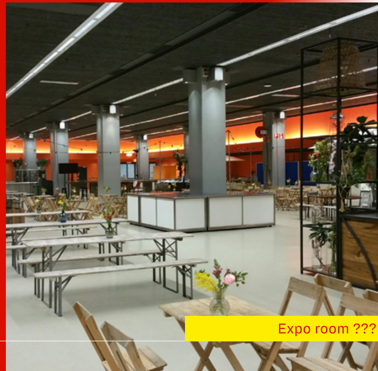
Expo room ???